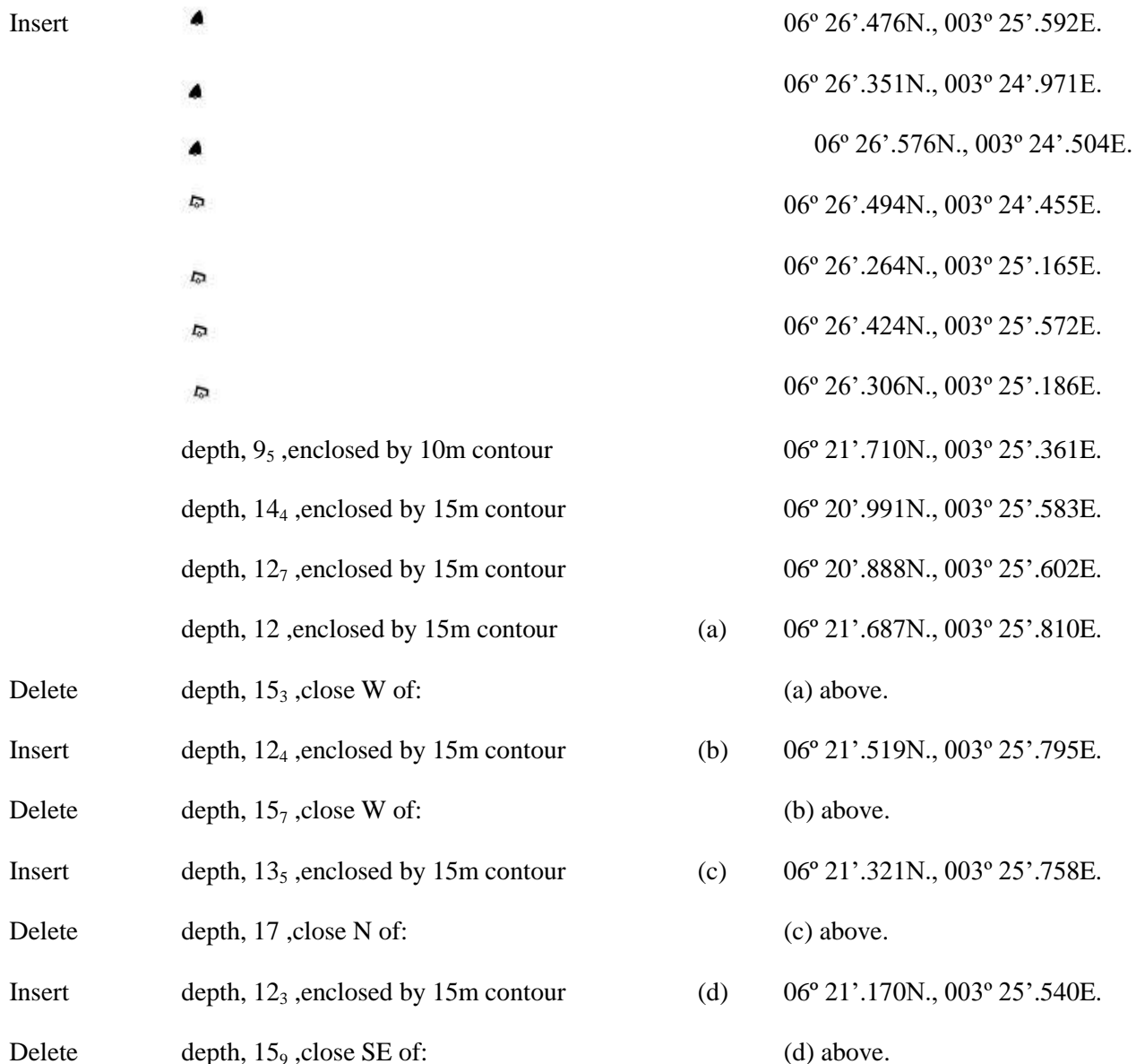
Chart 2501 (Lagos Harbour) WGS84 DATUM